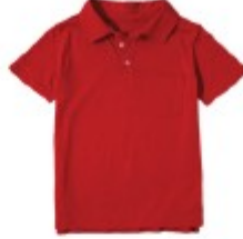
the polo $14