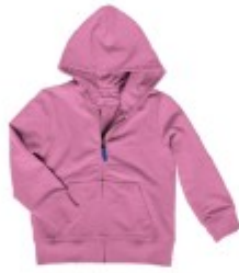
the hoodie $20