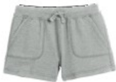
the track short $14