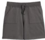
the gym short $14