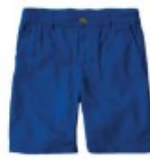
the short $16