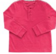
the henley $16