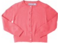
the cardi $24