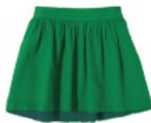
the reversible twirly $18