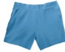
the midi short $16