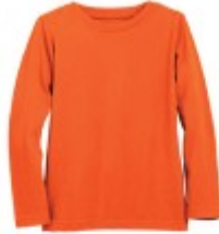
the classic l/s tee $10