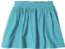
the pocket skirt $12