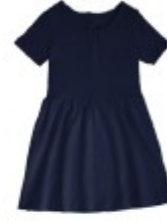
the short sleeve dress $16