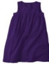
the swing dress $24