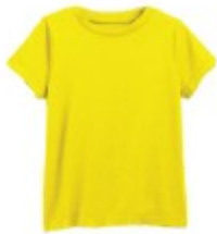
the classic tee $8