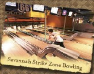
Savannah Strike Zone Bowling