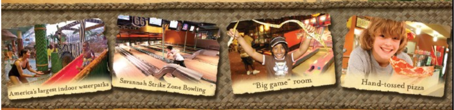
America's largest indoor waterparks

Mark your calendar to take a break!! Support your school while having fun! Get away without going too far from home to America's LARGEST indoor waterpark and enjoy a special rate for families and friends! Rooms are ONLY $134 and feature 2 Queen beds and INCLUDE waterpark passes! A portion from EACH room booked will benefit Kirtland Elementary PTA. BOOK EARLY to avoid being shut out. Book online today! https://book.passkey.com/e/49897869