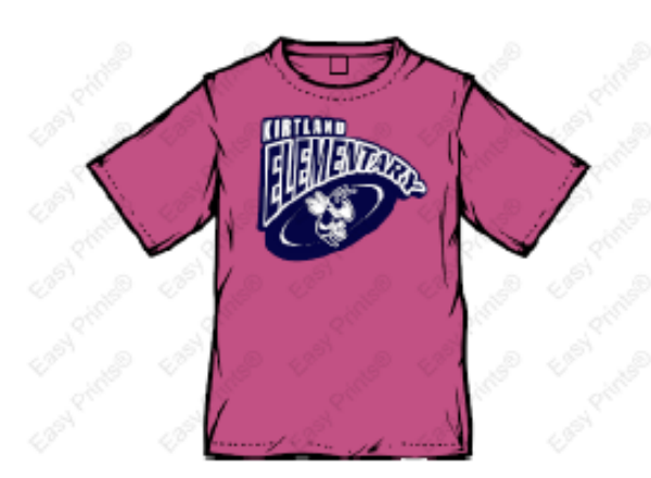
Design 1 Design 2

Get the latest Make it Club designs and make a difference! Profits from this sale will go to Hurricane Relief Performance T-Shirts $16.00 each or 2 for $30