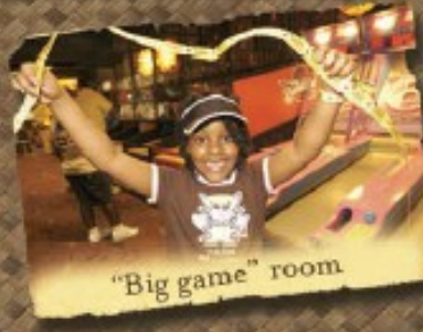
"Big game" room