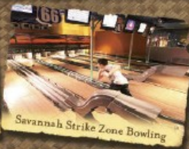
Savannah Strike Zone Bowling