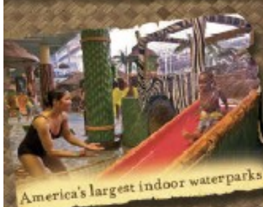
America's largest indoor waterparks

Mark your calendar to take a break!! Support your school while having fun! Get away without going too far from home to America's LARGEST indoor waterpark and enjoy a special rate for families and friends! Rooms are ONLY $122 and feature 2 Queen beds and INCLUDE waterpark passes! A portion from EACH room booked will benefit Kirtland Elementary. BOOK EARLY to avoid being shut out. For reservations call: 1-877-525-2427.